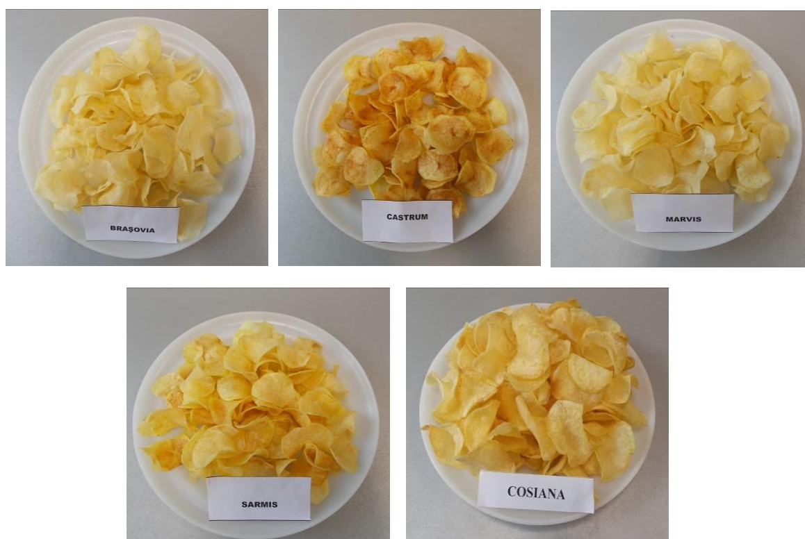
Figure 2. Suitability for processing into chips for the new potato varieties - Brașov 2015-2016

For each variety, it was taken a sample of three tubers. Potatoes were weighed before being peeled and after were peeled. The potatoes were washed and cut into thin slices of 1.75 mm using a grate. The slices were weighed and then washed several times in lukewarm water until the water remains clean, clear and were put to drain in a sieve.