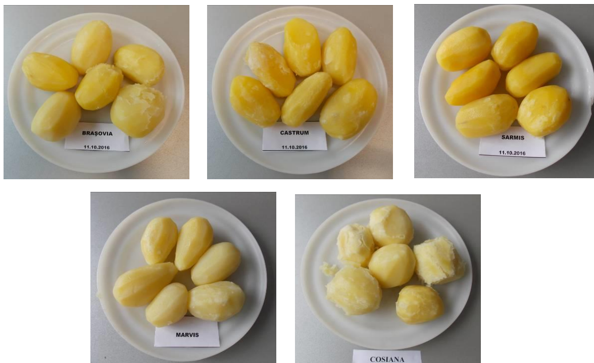
Figure 1. Appreciation of culinary quality to boiling for the new potato varieties Brașov 2015-2016

Type D: tubers have a very dry texture; includes potatoes which shatters excessive at boiling, sometimes totally and have a very poor consistency. The potatoes are not used in human consumption. In most countries, this type of potatoes are used in starch and alcohol industries.